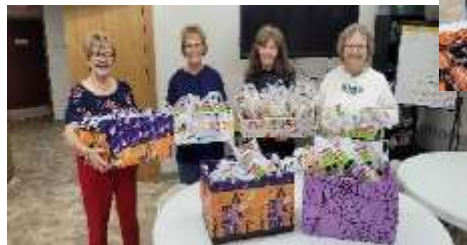
Packing Halloween Bags